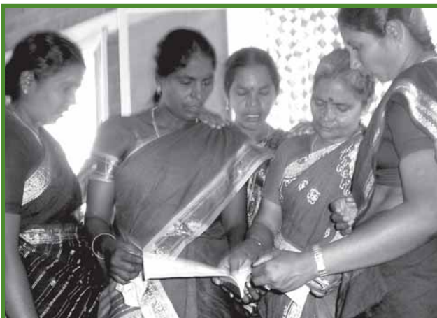
Community leaders look at emergency task force manual

Groots International has a strong commitment to promoting peer learning processes as a means of transferring knowledge and skills across grassroots groups. Over the last year, as part of our efforts to prepare a network of community trainers on resilience building GROOTS International in partnership with AJWS have been supporting grassroots leaders from nine different organizations to identify their skills and knowledge, prepare curriculum, tools and materials to train other disaster-prone communities.